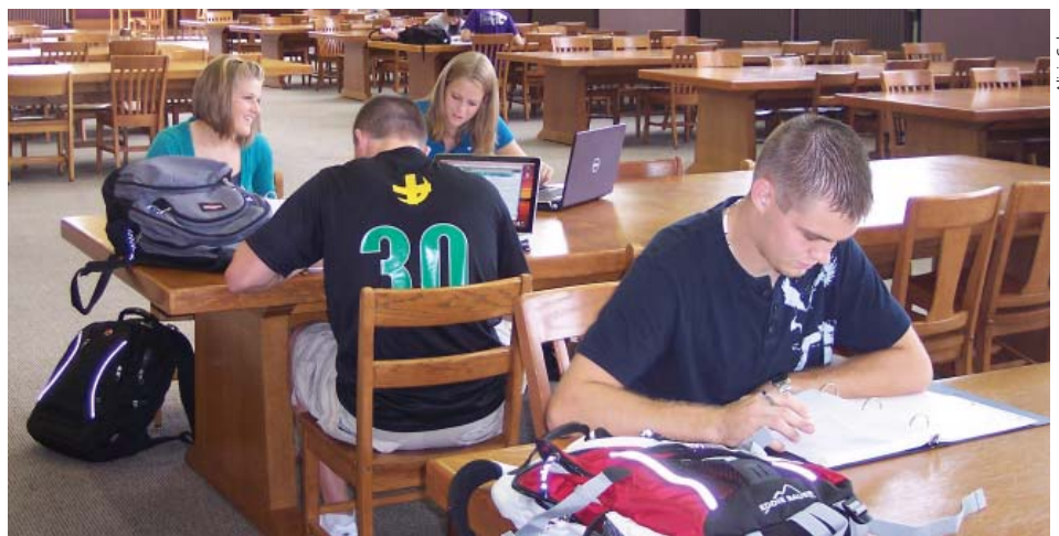
Students are constantly dealing with a barrage of emails, texts, activities, homework and distractions. Take steps to battle busyness before it becomes a problem.

It's time to push back. It's time to tell your "tools" who's in charge. It's time to move from being busy to beating busyness!