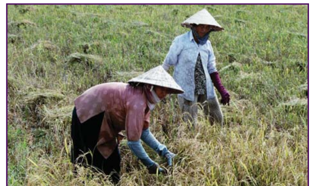
Rice farmers in rural Vietnam